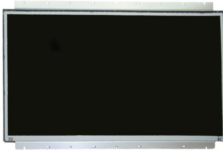
32" FHD OPEN FRAME MONITOR w/ AUO PANEL

Our 32" FHD Open Frame Display is designed to provide excellent performance and value for Amusement Gaming Signage and Kiosk customer that demand quality and reliability. This display will accept VGA or DVI-D inputs.